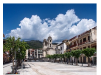
Zafferana, Mt. Etna

Visit the Mt. Etna, tallest active volcano in Europe. Stop in the town of Zafferana and visit a local rosticceria to learn how to make the famous arancini rice balls. Indulge in some exquisite cannoli, along with other local foods and wines. This afternoon, check into our breathtaking seaside hotel in Taormina and have a relaxing evening.