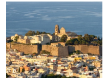
Lipari, Aeolie Islands

The last part of our journey takes the group to Milazzo, located on a small peninsula in the northeast corner of Sicily. From Milazzo, embark on a day cruise to the Aeolie Islands, featuring small active volcanos and amazing views. Upon returning to Milazzo, travel by coach to Cefalù for the final stay of our tour. Check into our fantastic seaside hotel for the last two nights. A nice dinner is included at the hotel.