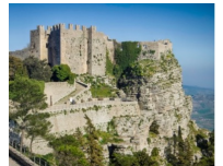
Norman Castle - Erice

This morning, take a tour of Palermo, the capital of Sicily, rich with ancient buildings, cathedrals, and gardens. Palermo has many hidden treasures such as the impressive Monreale Cathedral, an example of Norman architectural style which contains over 2 tons of gold mosaics. In the afternoon, enjoy free time to shop the local stores and colorful food markets. Dinner is at your leisure.