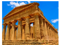
Valley of the Temples, Agrigento

Today visit Segesta, one of the most well-preserved Greek Sicilian temples. After returning to the Donna Franca, take a tour of their popular wine cellar. Taste some appetizers and some of their specialty wines. Afterwards, enjoy a cooking school demonstration followed by dinner, featuring some of the foods that you prepared?