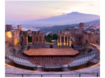
Greek Roman Theater, Taormina

After breakfast, take the funicular to the village of Taormina. After a guided tour of the area, including the Greek Roman Amphitheater, there will be plenty of time to explore all of the colorful streets and shops overlooking the Mediterranean east coast. This evening's dinner is at leisure.