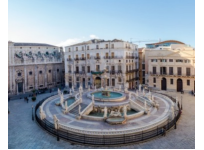
Piazza Pretoria, Palermo

Arrive at Palermo airport and be greeted by your Wherever Tours tour leader. A private transfer from the airport to the hotel will be available with scheduled arrivals*. After your hotel check-in, relax and enjoy the Five Star hotel during your day in Palermo. A welcome reception will follow with traditional appetizers and a taste of wine. Tonight's included dinner features delicious local cuisine, especially the fresh seafood and regional wines.