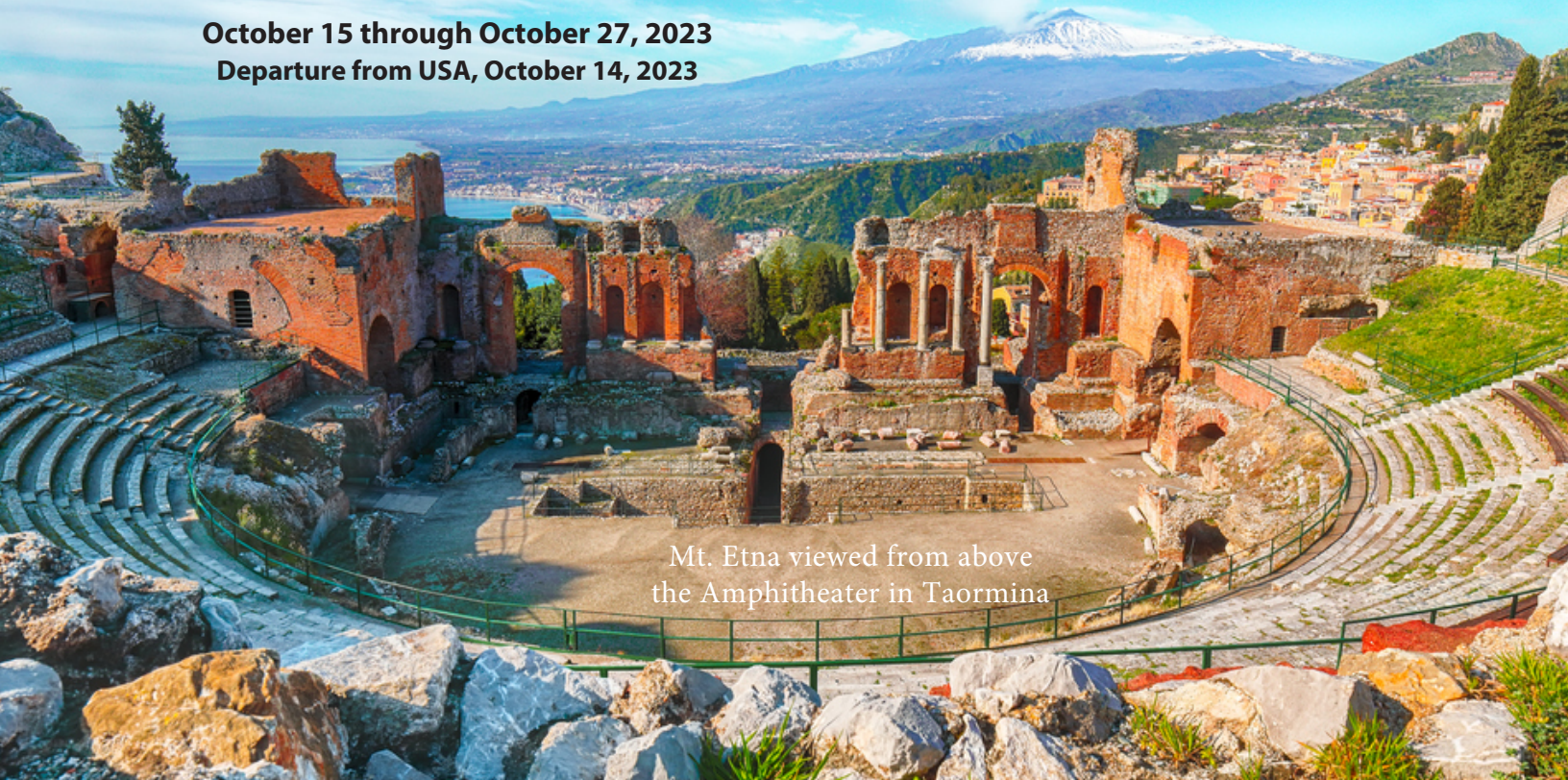
Mt. Etna viewed from above the Amphitheater in Taormina

October 15 through October 27, 2023 Departure from USA, October 14, 2023