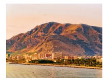
Palermo at Sunrise

Sadly we must say "arrivederci" to Sicily. After breakfast, transfer from the hotel to the Palermo airport for your onward journey.