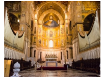
Monreale Cathedral, Palermo