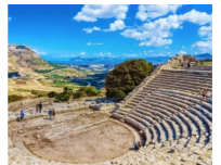
Roman Amphitheater, Segesta

After breakfast, travel by luxury coach along the magnificent northern coastline of the Tyrrhenian Sea to Trapani. On the way, we'll stop in the mountaintop town of Erice with its breathtaking views. In the afternoon arrive in Trapani, known for its salt flats and the beautiful Cathedral of San Lorenzo. Later, arrive in Marsala to the Donna Franca, a perfectly preserved and restored baglio from the 19th century. Tonight, enjoy a specially prepared dinner at the hotel's renowned restaurant.