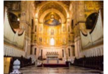
Monreale Cathedral, Palermo

This morning, take a tour of Palermo, the capital of Sicily, rich with ancient buildings, cathedrals, and gardens. Palermo has many hidden treasures such as the impressive Monreale Cathedral, an example of Norman architectural style which contains over two tons of gold mosaics. After the tour, prepare yourself for a big surprise. This afternoon, enjoy some free time back in Cefalù. Dinner is at your leisure.