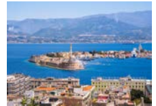
Straits of Messina

Day 10 Fri, 18-Oct-2024 Straits of Messina, Calabria, Sorrento Villa Giovanna, Sorrento (B,D) After breakfast, we depart Sicily and make our way to Sorrento. We'll take a ferry boat cruise across Straits of Messina to the mainland of Italy Then we'll make a stop in the region of Calabria, in Southern Italy, for a relaxing lunch stop. Later in the afternoon, arrive in the hotel in Sorrento, overlooking the Gulf of Naples, for a nice dinner with music, dancing and wine.