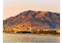
Palermo at Sunrise

Arrive at Palermo airport and be greeted by your Wherever Tours tour leader. A private transfer from the airport to the resort hotel in Cefalù will be available with scheduled arrivals*. After your hotel check-in, relax and enjoy the beautiful hotel pool or venture down to the beach or just relax in your room. A welcome reception will follow, with traditional appetizers and a taste of wine. Tonight's included dinner in the hotel restaurant features delicious local cuisine and regional wines.