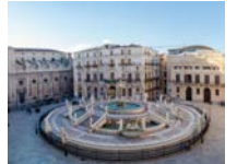
Piazza Pretoria, Palermo

After breakfast, travel by luxury coach along the magnificent northern coastline of the Tyrrhenian Sea to Trapani. On the way, we'll stop in the mountaintop town of Erice with its breathtaking views. In the afternoon arrive in Trapani, known for its salt flats and the beautiful Cathedral of San Lorenzo. Later, arrive in Marsala to the Donna Franca, a perfectly preserved and restored baglio from the 19th century. Tonight take a tour of the winery, and taste the region's most famous wines during dinner at the hotel's renowned restaurant.