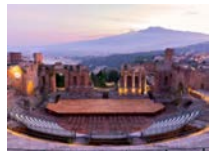
Greek Theater, Taormina

After breakfast, take the funicular to the village of Taormina. After a guided tour of the area, including the Greek Roman Amphitheater, there will be plenty of time to explore all of the colorful streets and shops overlooking the Mediterranean east coast. This evening's dinner is at leisure.