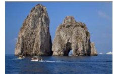
Faraglioni Rocks, Capri

Day 12 Sun, 20-Oct-2024 Positano Villa Giovanna, Sorrento (B,D) This morning, head out to the Amalfi Coast, a UNESCO World Heritage Site. Have cameras ready for a spectacular view of Positano where there will be free time to shop and explore this beautiful seaside town, featured in many famous movies and magazines. Later, enjoy the "Ultima Cena" (Last Supper) in Sorrento. Great food, music, and song and dance will complete this unforgettable stay in Sorrento, creating memories that will last a lifetime.