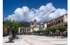
Zafferana, Mt. Etna

Day 8 Wed, 16-Oct-2024 Mt. Etna, Zafferana Panoramic Hotel, Taormina (B,L) Eat a good breakfast this morning, because today we visit Mt. Etna, the tallest active volcano in Europe. Stop in the town of Zafferana and visit a local rosticceria to learn how to make the famous arancini rice balls. Indulge in some exquisite cannoli, along with other local foods and wines. This afternoon, return to our breathtaking seaside hotel in Taormina and have a relaxing evening.