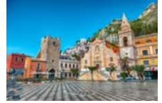
Piazza IX Aprile, Taormina

Day 9 Thu, 17-Oct-2024 Free time, Optional: Visit to Siracusa Panoramic Hotel, Taormina (B,D) Today, take some free time to lay on the beach or by the pool, or explore and shop Taormina on your own. Tonight, enjoy a dinner prepared by a very famous Sicilian chef, Crisitian Foti. Plenty of wine and local singers will transform this night in to a festive party. Optional Experience: An optional trip to Siracusa will be offered by your tour leader. This all-day experience will introduce and enlighten you to the most multi-cultural city in Sicily.