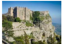
Norman Castle - Erice