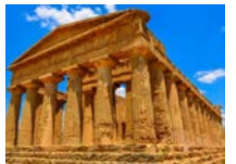
Valley of the Temples, Agrigento

This morning, travel from Marsala to Agrigento, located on the southern coast of Sicily on the Mediterranean Sea. A local expert will highlight the important ancient treasures on a tour of the Valley of the Temples, dating back to the fifth century BC. This archeological site was added to the UNESCO World Heritage List in 1997. Back at the hotel, enjoy a tasty dinner with wine.