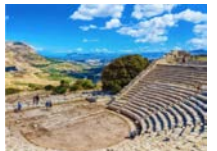
Roman Amphitheater, Segesta

Today visit Segesta, one of the most well-preserved Greek Sicilian temples. After returning to the Donna Franca, take a tour of their popular wine cellar. Taste some appetizers and some of their specialty wines. Then, enjoy a cooking class, followed by dinner featuring some of the foods that you prepared earlier.