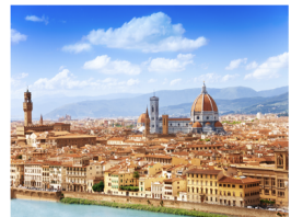
Cityscape of Florence

Today, journey to the capital of Tuscany and the "Birthplace of the Renaissance", Florence. A local expert leads the group on a sensational walking tour through the area, renowned for its art and museums. Visit the Cathedral, Town Hall Square, The Old Bridge, the Holy Cross Church and the tombs of Michelangelo, Galileo, Joaquin Rossini, and Nicholas Machiavelli. The tour is highlighted with a visit to The Academy of the Fine Arts featuring Michelangelo's Statue of David. Enjoy a demonstration at a local leather factory. Take some free time to shop and explore. Afterwards, head to Montecatini and hotel check in. Dinner will be in the hotel restaurant, with plenty of good wine.