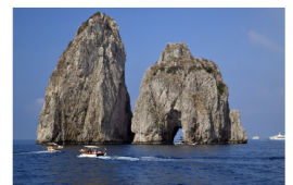
Faraglioni Rocks of Capri

After a leisurely breakfast, head out for an excursion to the Amalfi Coast, a UNESCO World Heritage Site. Have cameras ready for a spectacular view of Positano where there will be free time to shop and explore this beautiful seaside town, featured in many famous movies and magazines. Spend some time on the beautiful beach before returning back to the Villa Giovanna. Tonight, enjoy our "ultima cena" (last dinner) in Sorrento. An outdoor barbecue with music and dancing will complete this unforgettable stay in Sorrento, creating memories that will last a lifetime.