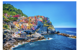
Cinque Terre, Tuscany

This morning, take a short drive to the Italian Riviera and La Spezia. In La Spezia, board a ferry boat and cruise to one of the beautiful Cinque Terre cliffside villages. Take plenty of time to shop and explore. Stroll along the pristine shores of the Mediterranean. Board a classic train back to La Spezia while taking in breathtaking views of the seascape. Back at the hotel, take some time to freshen up before taking a short trip to Lucca. Take a brief, but interesting tour of a local vineyard and then enjoy a festive Tuscan dinner, with wine and music.