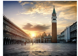
St. Mark's Square

This morning, board a private boat and sail to the island of Murano to visit one of the world's oldest and famous glass blowing factories. Witness the expert craftsmanship of the artisans whose skills have been passed down hundreds of years. Proceed to the heart of Venice, cruising along the famous Grand Canal lined up with all the beautiful palazzi. Enjoy an orientation tour of St Mark's Square with the iconic Doge's Palace, St. Mark's Basilica & Tower, Bridge of Sighs and the Rialto Bridge. Take some free time to explore Venice, or take an optional gondola ride through the Venetian canals.