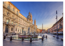
Piazza Navona, Rome

Today, join our tour guide to see some of the most beautiful sights of Rome, such as the Pantheon, the beautiful Navona Square, the Spanish Steps, the Trevi Fountain and other treasures of Rome. Take the rest of the day to explore on your own, or take advantage of an Optional visit of one of the Catacombs around the Eternal City. Tonight, enjoy a farewell dinner at Lucky's restaurant which includes a cooking exhibition, music and plenty of choice wine. Before returning to the hotel, enjoy an illumination tour of the Eternal City...a great way to accentuate your stay in Rome.