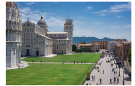
Leaning Tower, Miracle Square

After breakfast and hotel checkout, depart for Rome, but not before visiting one of the most iconic structures in all of Italy, the Leaning Tower of Pisa. The tour director will lead the group to Miracle Square where you will admire the tower. Make sure to take dozens of corny photos of friends holding up the tower, preventing it from collapse. Pisa is poised along the Aurelian Way, an ancient trade route that leads to Rome and, our Rome hotel. After comfortably settling into the hotel, enjoy a pizza party at a nearby Roman restaurant.