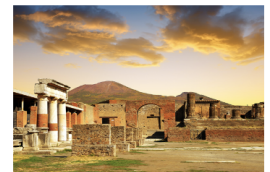
Pompeii, Mount Vesuvius

After checkout of the Rome hotel, board the motorcoach for Sorrento. Along the way, visit Pompeii, a perfectly preserved archeological site that was completely buried in ash by the cataclysmic eruption of Mt. Vesuvius in 79 AD. Our private expert will guide you through this incredible city, frozen in time for nearly 2000 years. Then we take a short drive to the slopes of Vesuvius for a unique lunch and winetasting experience. Savor the famous Lacryma Christi (Tears of Christ) wines, produced for centuries only on this fertile volcanic soil. Later, arrive for check-in to our villa hotel in Sorrento.