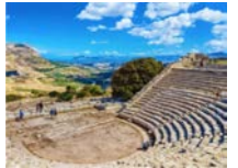
Roman Amphitheater, Segesta

Today visit Segesta, one of the most well-preserved Greek Sicilian temples. After returning to the Donna Franca, take a tour of their popular wine cellar. Taste some appetizers and some of their specialty wines. Then, enjoy a cooking class, followed by dinner featuring some of the foods that you prepared earlier.