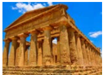
Valley of the Temples, Agrigento

This morning, travel from Marsala to Agrigento, located on the southern coast of Sicily on the Mediterranean Sea. A local expert will highlight the important ancient treasures on a tour of the Valley of the Temples, dating back to the fifth century BC. This archeological site was added to the UNESCO World Heritage List in 1997. Back at the hotel, enjoy a tasty dinner with wine.